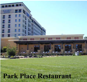
Park Place Restaurant

Blue Monkey Taco Lounge - 1 E. San Fernando, Downtown San Jose. A cantina from the same owners as Chacho's restaurant in downtown. Located in the former California Sushi next to Gordon Biersch. Chacho's is a long-time favorite – look for this to be good authentic cuisine. Currently scheduled to open in May or June.